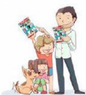
Families order from Book Club.

Every purchase you make earns your child's school 15% of your order value in Scholastic Rewards that can be used to purchase valuable educational resources that benefit your child.