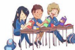
The school earns Scholastic Rewards.