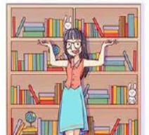
The school redeems Scholastic Rewards for additional resources