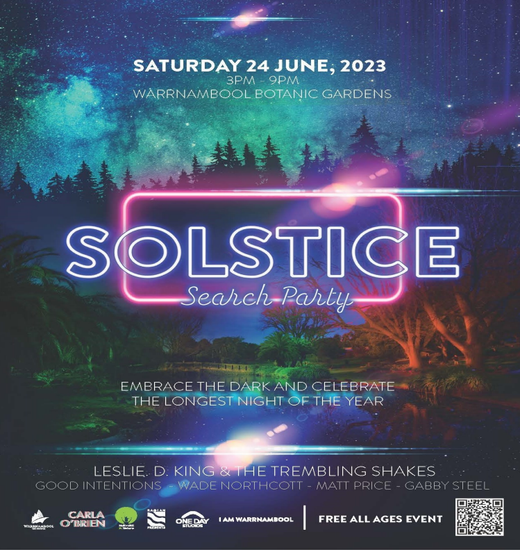
Solstice Search Party – Saturday 24<sup>th</sup> June 2023 Warrnambool Botanic Gardens 3pm – 9pm

https://whatson.warrnambool.vic.gov.au/solstice-searching-0